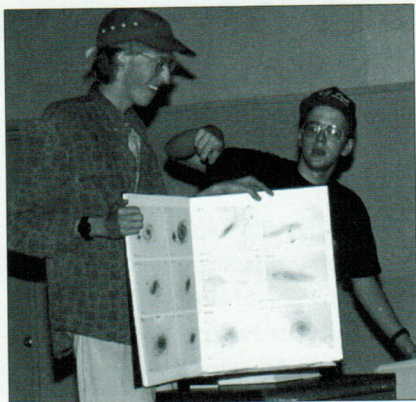
far right: Campers and counselors analyzing research results.