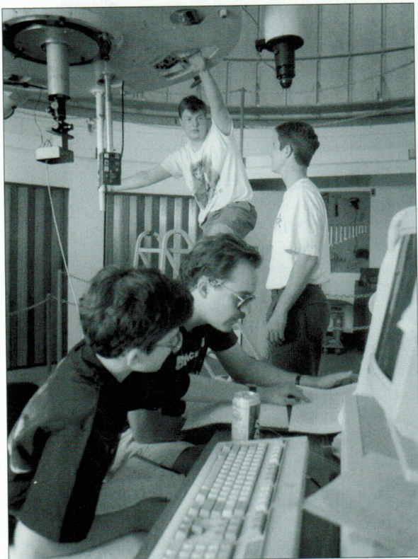
above: Astronomy Campers at the 60-inch telescope on Mt. Lemmon.

ing proposal, a simplified version of the proposals professional astronomers must write to conduct their research. Groups of collaborating campers were asked to write a brief scientific justification of their proposed work and a defense of their choice of telescope and instrument.