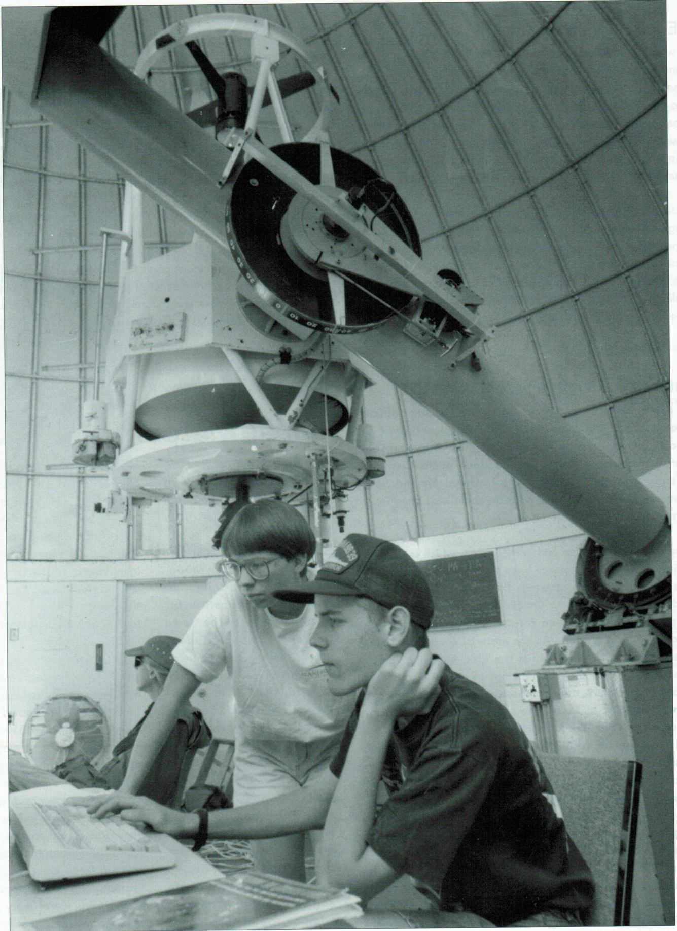
Astronomy Campers using a CCD-spectrograph on the 40-inch telescope at Mt. Lemmon.